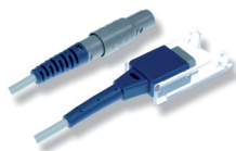
Extension cable Lemo-DSUB For desktop devices, 150 cm Order No. 00309

Medlab medizinische Diagnosegeräte GmbH Helmholtzstrasse 1a, 76297 Stutensee - Germany Tel. +49 (0) 7244 74110-0, FAX +49 (0) 7244 74110-28 sales@medlab.eu, www.medlab.eu